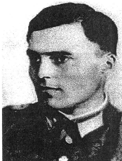
Photo of Colonel von Stauffenberg

Search the WWII Foreign Military Studies, 1945-54 Find reports, interviews, questionnaires and more conducted during WWII from this Collection. From Footnote.Com