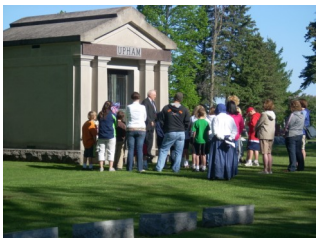
4 Gov. William H. Upham