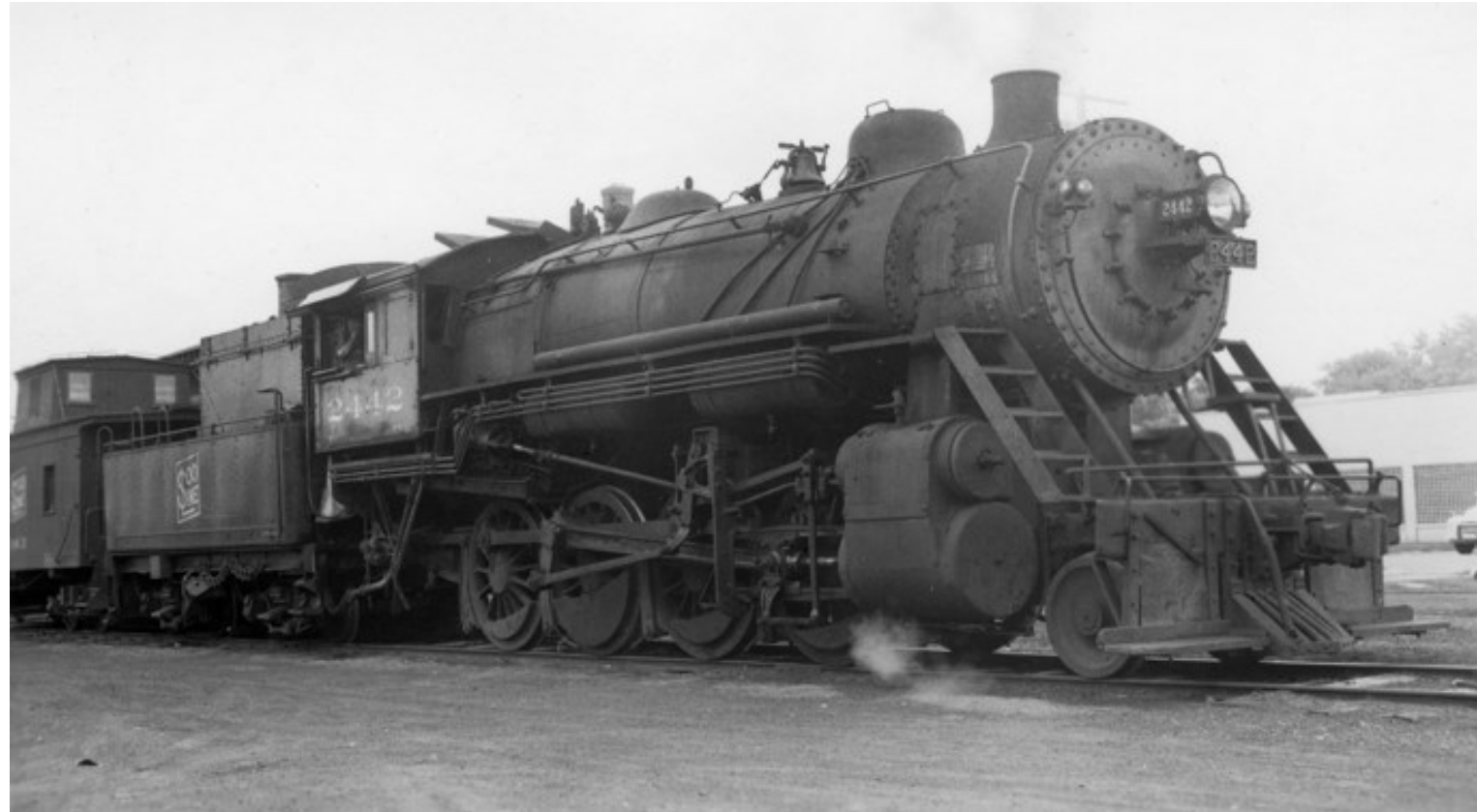
Soo 2442 at Nekoosa, 2-8-0, July 8, 1953

43 years, 2442 ran up a cumulative mileage of 1,518,932 in her 43-year career on the Soo Line.