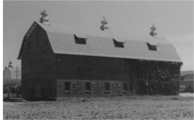
Wood County Asylum Horse Barn

With all of its other points of superiority there is yet one which points it out as the most individual barn in the world.