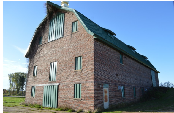
Back side of Norwood horse barn.

Photo taken by Vickie Schnitzler, October 2, 2019