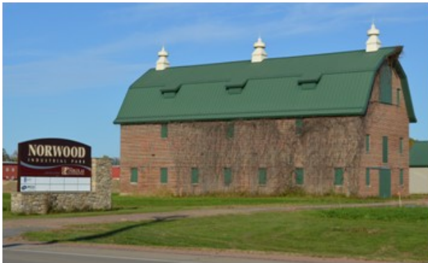
This is the last remaining building of the Wood County Asylum Hospital and Farm complex, also known as Norwood. It is now a part of the Norwood Industrial Park.

(from Marshfield News-Herald, Marshfield, Wisconsin, 06 Dec 1930, Page 5)