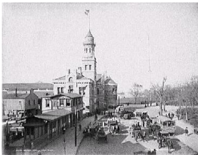
The Barge Office

Immigration processing was moved back to the old