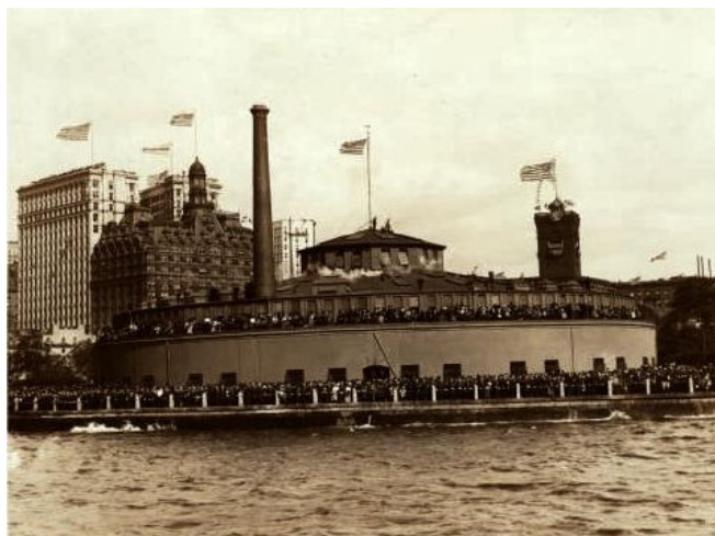
State Emigrant Landing Depot, Castle Garden, New York.

Ellis Island seems to receive all the publicity for immigrants arriving in New York City. Many people do not realize that Ellis Island did not begin operations until 1892. More than 73 million Americans can trace their ancestry to immigrants who arrived in New York City prior to that year. From 1830 until 1890, these new arrivals first stepped ashore at Castle Garden in lower Manhattan.