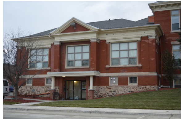
The old Marshfield Public Library as it sits today as part of Tower Hall Apartments.

Built in 1900-01 as the city's 1 st library; designed by Van Ryan & DeGelleke. The main façade has a pedimented pavilion entry outlined by a simple cornice with a flat frieze with denticulated pattern. That pattern extends around the building. Here it rests on attached piers. The cornice on the current entry below rests on small square piers sitting on tall brick pedestals. The original entry was within the window above; much of the now visible fieldstone foundation was then below grade, & exterior stairs led up to the door. Window sills & the band surrounding the building between floors are limestone. Most 2 nd story windows have "capitals" above, & 2 on the main façade have "piers" on both sides. The corners of the building have engaged piers, visually supporting the hipped asphalt shingled roof.