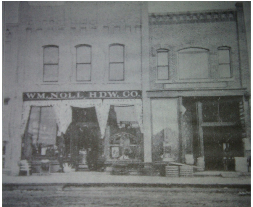
Double store of Wm. Noll Hardware Co. with addition to the south (on right) being built sometime between 1887 and 1891.