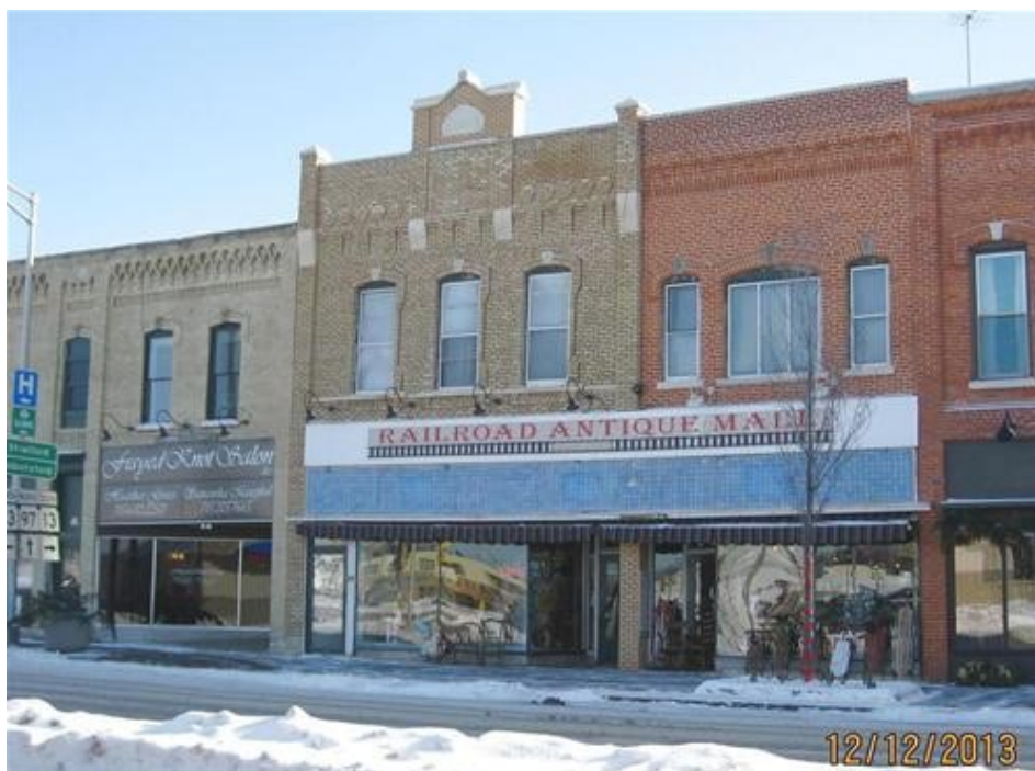
Railroad Antique Mall.