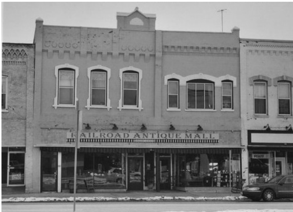
Railroad Antique Mall, 2007.

For additional stories on the historical sights and businesses of Marshfield, visit our website at: http://www.marshfieldgenealogy.com/QR-Codes-of-Historical-Marshfield.html .