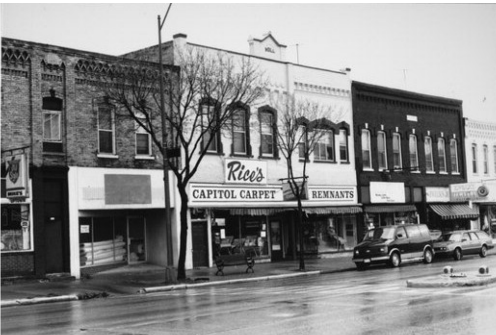
Rice Capital Carpet and Remnants

This enterprise occupied the building through 1912. In 1891 through 1904, Agricultural implements were stored and sold in the south addition. In 1925 and 1946, the building is occupied by an unidentified store. In these years, the dividing wall between the two building sections was removed on the first floor, and existed only on the second floor. The historic addresses of this property were: in 1887 (855 1/2?) South Central Avenue, from 1891 through 1946, 109 and 111 South Central Avenue. In 1946, the address given to the property was 119-121.