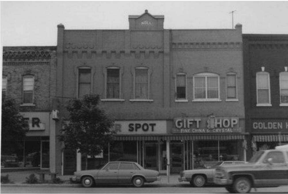
Mautz Color Spot and Noll Gift Shop, mid 1970's.

This enterprise occupied the building through 1912. In 1891 through 1904, Agricultural implements were stored and sold in the south addition. In 1925 and 1946, the building is occupied by an unidentified store. In these years, the dividing wall between the two building sections was removed on the first floor, and existed only on the second floor. The historic addresses of this property were: in 1887 (855 1/2?) South Central Avenue, from 1891 through 1946, 109 and 111 South Central Avenue. In 1946, the address given to the property was 119-121.